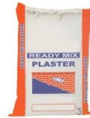
Gypsum / Gypsum Plaster